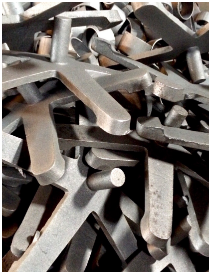
CAST IRON CHAIR PART "Raw grey cast iron parts "

Strength, Flexibility, Variety are grey iron cast product's speciality.