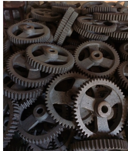
CAST IRON GEARS "Raw grey cast iron parts"

One of the most popular product in cast iron items is Gears. It's application is the part of crusher machine. Even not a difficult item but the surface of casting need to be well cast to reduce the processing cost. Product have been selling to domestics market and some model to Taiwan.