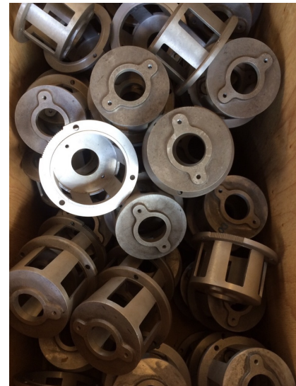
ALUMINUM CAST "Machine parts"

One of the most popular application of aluminum cast products is Motor cover parts. It's flexibility, easy to carry and processing. That why we have variety of Aluminum Machine parts. Our main market is Japan, USA.