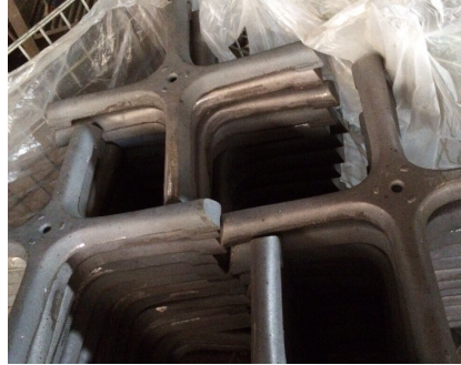
CAST IRON TABLE PART "Raw grey cast iron parts "