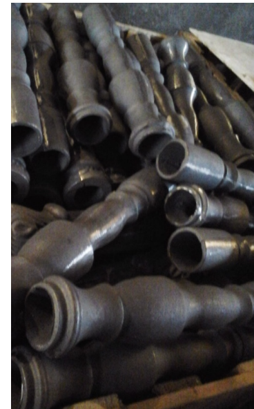
CAST IRON LAMPPOST "Raw grey cast iron parts "

We've have been exporting over 20 kind of lampposts since 2009 to USA, EU and Taiwan.