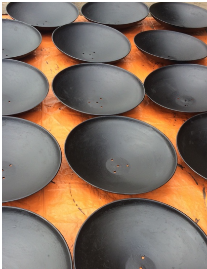
CAST IRON BOWL "with black heat resistant paint"

The fire bowl made from grey cast iron and cover by black heat resistance painting. It's can be stand of 500 degree celsius. Product have been exporting to EU market.